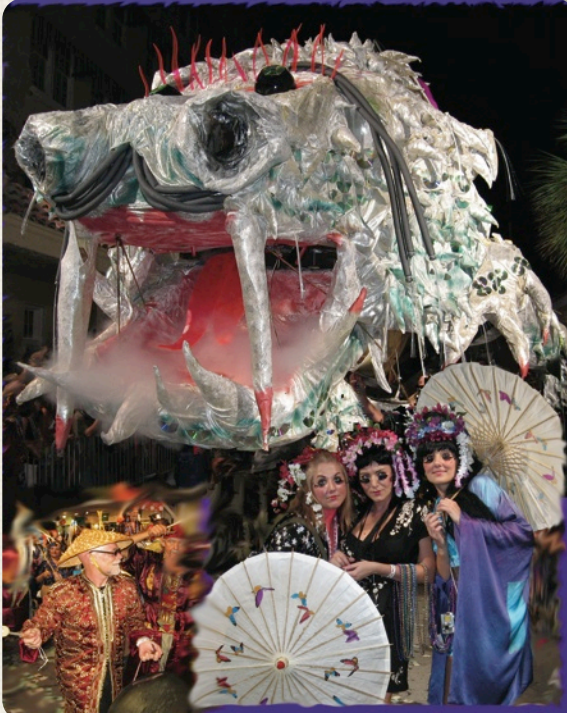
GRAND PRIZE WINNER 2008- DRAGON BOATS