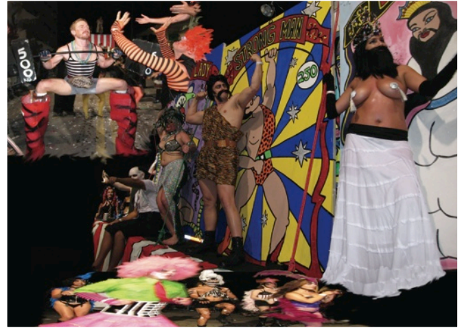
PRIZE WINNER 2008 - KEY WEST BURLESQUE